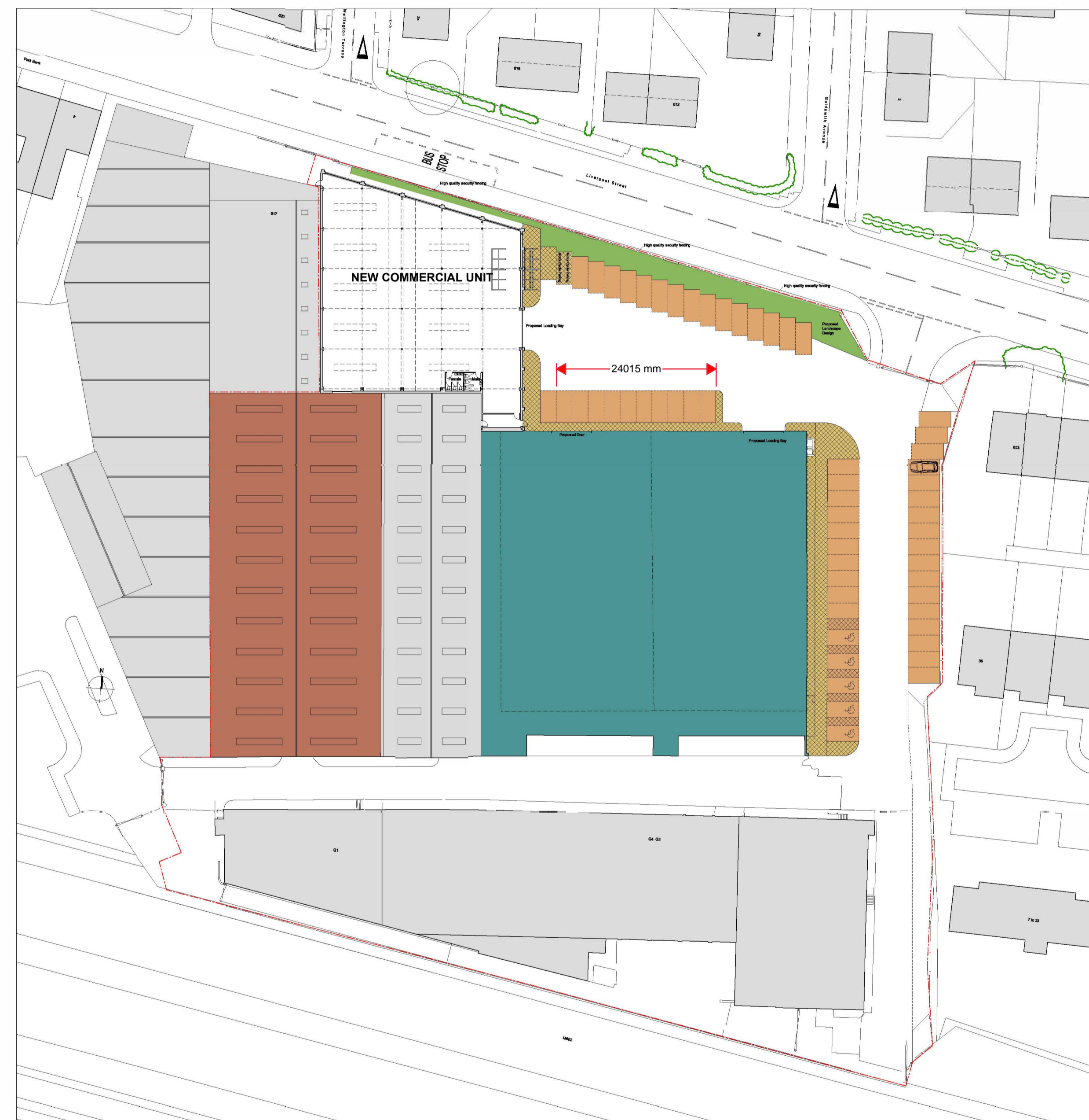
Proposed Site Plan 1:500