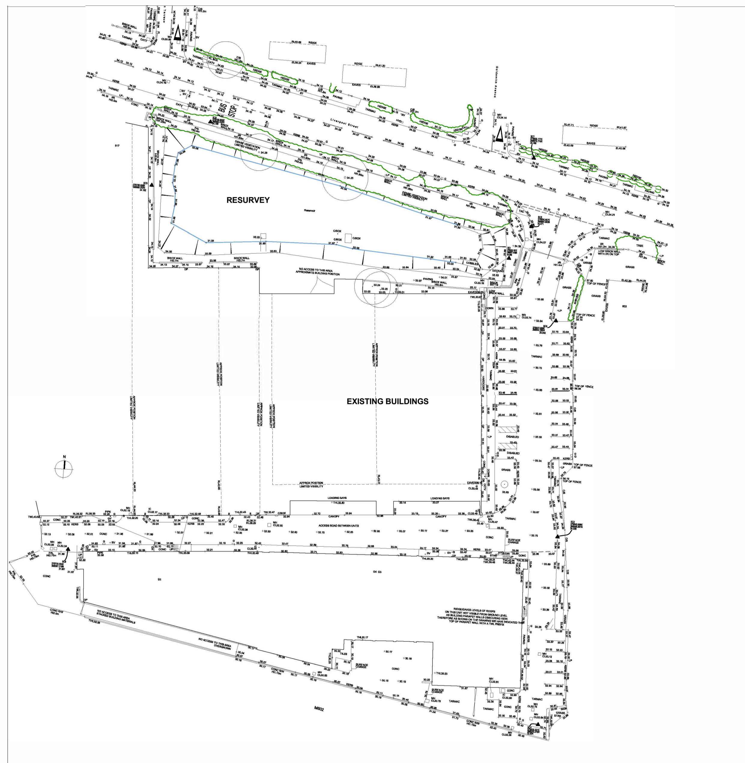
Existing Site Plan 1:500